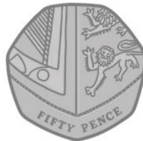
50p Fifty Pence