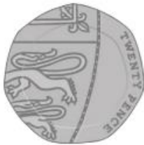
20p Twenty Pence