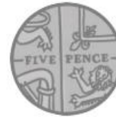
5p Five Pence