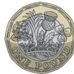
£1 One Pound