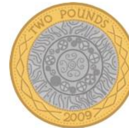
£2 Two Pounds