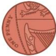
1p One Penny