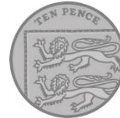
10p Ten Pence