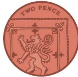
2p Two Pence